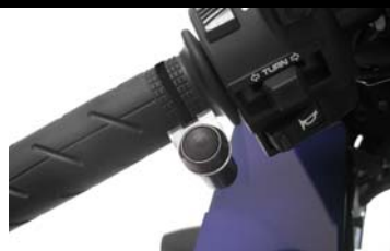
HANDLE BAR PRESS TO TALK SWITCH