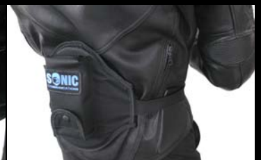
EXAMPLE OF POUCH FITTED