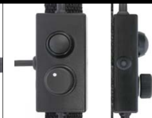
JUNCTION BOX WITH VOLUME CONTROL